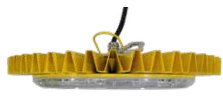
3' cord and plug

Recommended spacing is approximately 50' apart to reach 5-foot candles of light coverage in most applications. Talk to us about designing an optimal temporary lighting layout for your project.